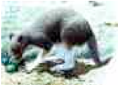
Australian giant rat has tendons.

(c) A compact bone specimen has L = 150 \text{ mm} , and an elliptic cross section with semi-major dimensions outer a_o = 20 \text{ mm} , and inner a_i = 15 \text{ mm} ; semi-minor dimensions outer b_o = 15 \text{ mm} , and inner b_i = 10 \text{ mm} , how much force is needed to break it?